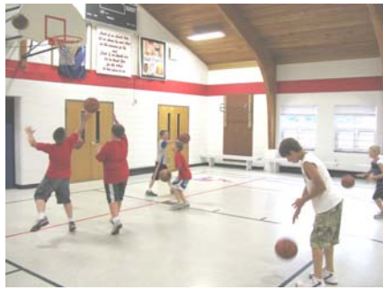
Improve your basketball skills!