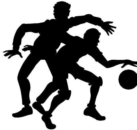
Improve your basketball skills!